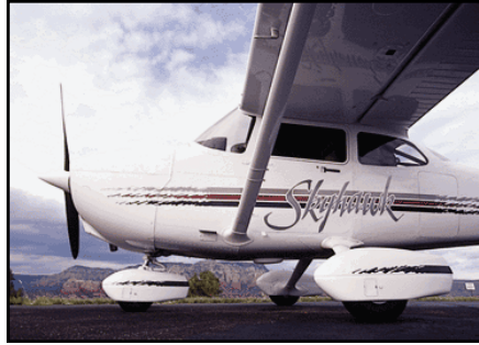
CESSNA 172 SKYHAWK